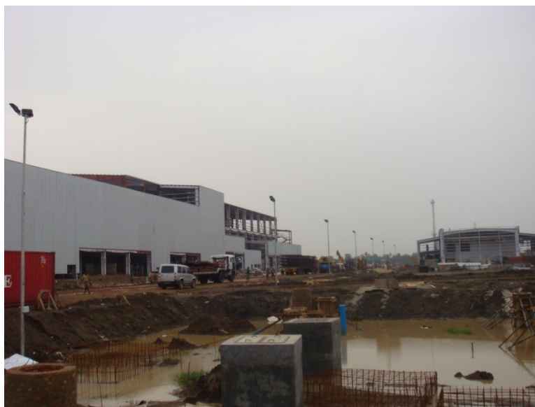
Figure 2: Factory was built on the acquired land in August 2008.