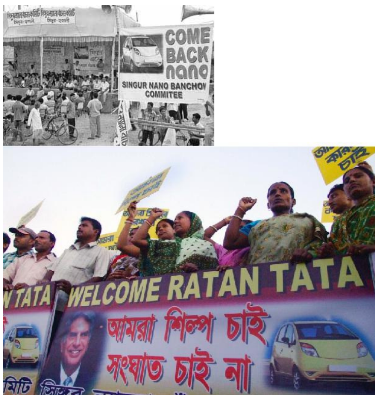
Figure 3: Counter-protests to bring back the factory after Tata Motors pulled out in November 2008