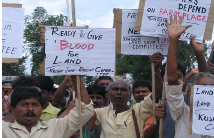
Figure 1: Protests against Land Acquisition, Singur October 2006.

the popular appeal of these ultra-leftists and the post-developmental activist 6 and their agenda remain marginal in the agriculturally fertile parts of West Bengal, such as Singur. The anti-land acquisition protests, which were seen by the ultra-left as a spontaneous resistance to neoliberal policies of the central government consolidated the position of the Trinamul Congress in the province, a stronger ally of the neoliberal regimes at the center. 7